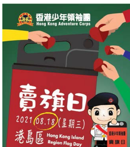
(Flt Lt Cherry C Y CHAN) OC CSS

**** 參考格式 xxx Sqn-2117B-18 Aug 2021 ****